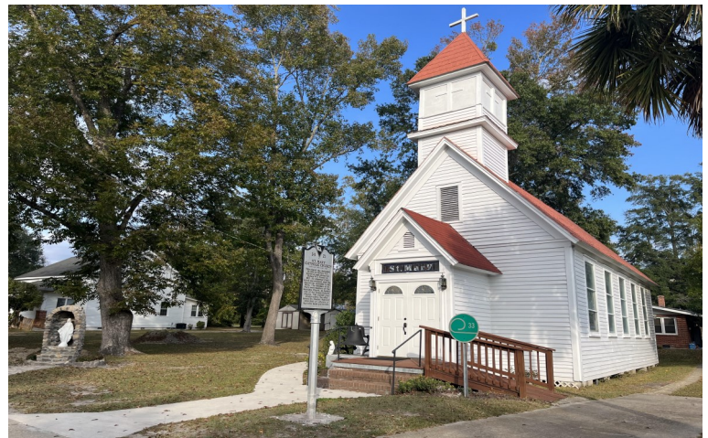
St. Mary Mission Church 12 N. Cantey St Summerton SC 29148