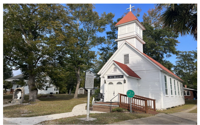
St. Mary Mission Church 12 N. Cantey St Summerton SC 29148