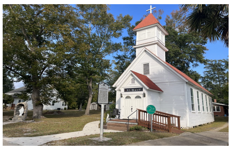
St. Mary Mission Church 12 N. Cantey St Summerton SC 29148