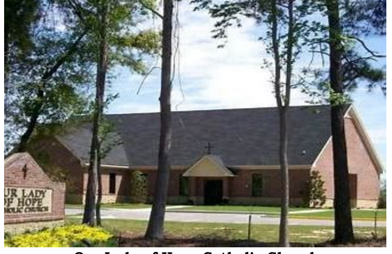
Our Lady of Hope Catholic Church 2529 Raccoon Road, Manning, SC 29102