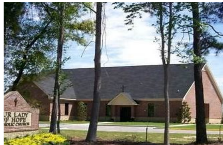
Our Lady of Hope Catholic Church 2529 Raccoon Road, Manning, SC 29102