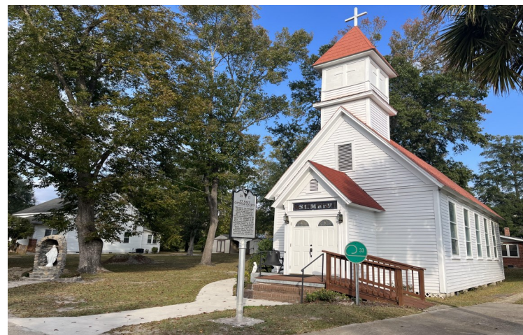
St. Mary Mission Church 12 N. Cantey St Summerton SC 29148