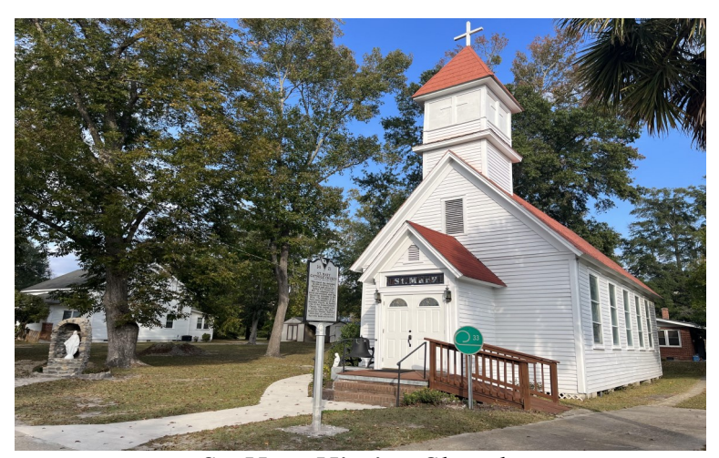
St. Mary Mission Church 12 N. Cantey St Summerton SC 29148