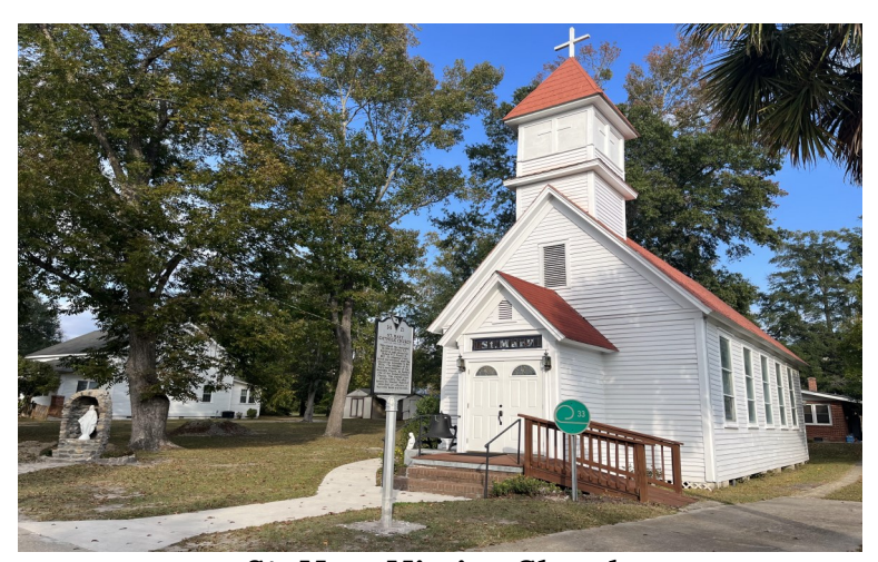
St. Mary Mission Church 12 N. Cantey St Summerton SC 29148