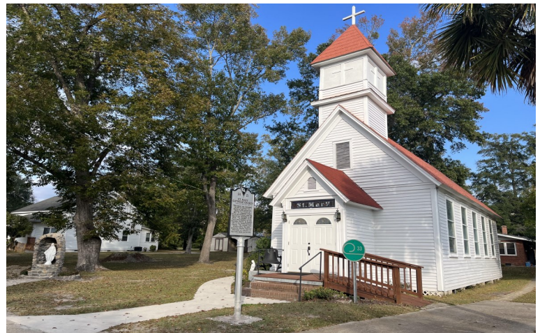
St. Mary Mission Church 12 N. Cantey St Summerton SC 29148