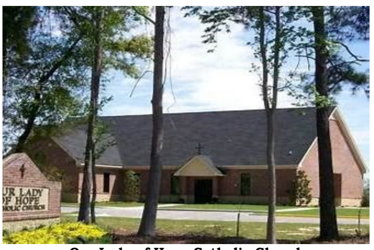
Our Lady of Hope Catholic Church 2529 Raccoon Road, Manning, SC 29102