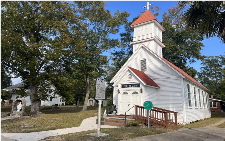
St. Mary Mission 12 N Cantey St Summerton SC 29148