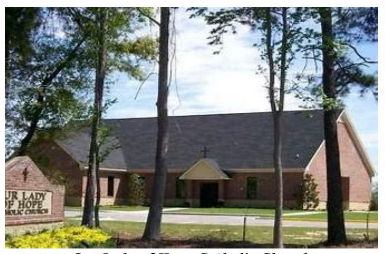
Our Lady of Hope Catholic Church 2529 Raccoon Road, Manning, SC 29102