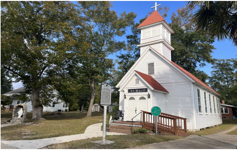
St. Mary Mission 12 N Cantey St Summerton SC 29148